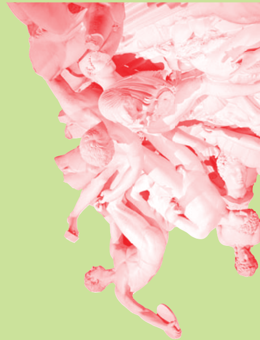
Christine O'Loughlin born Australia 1948 Cultural rubble (detail) 1993 reinforced polyester resin The University of Melbourne Art Collection with funds provided by the Ian Potter Foundation 1993.